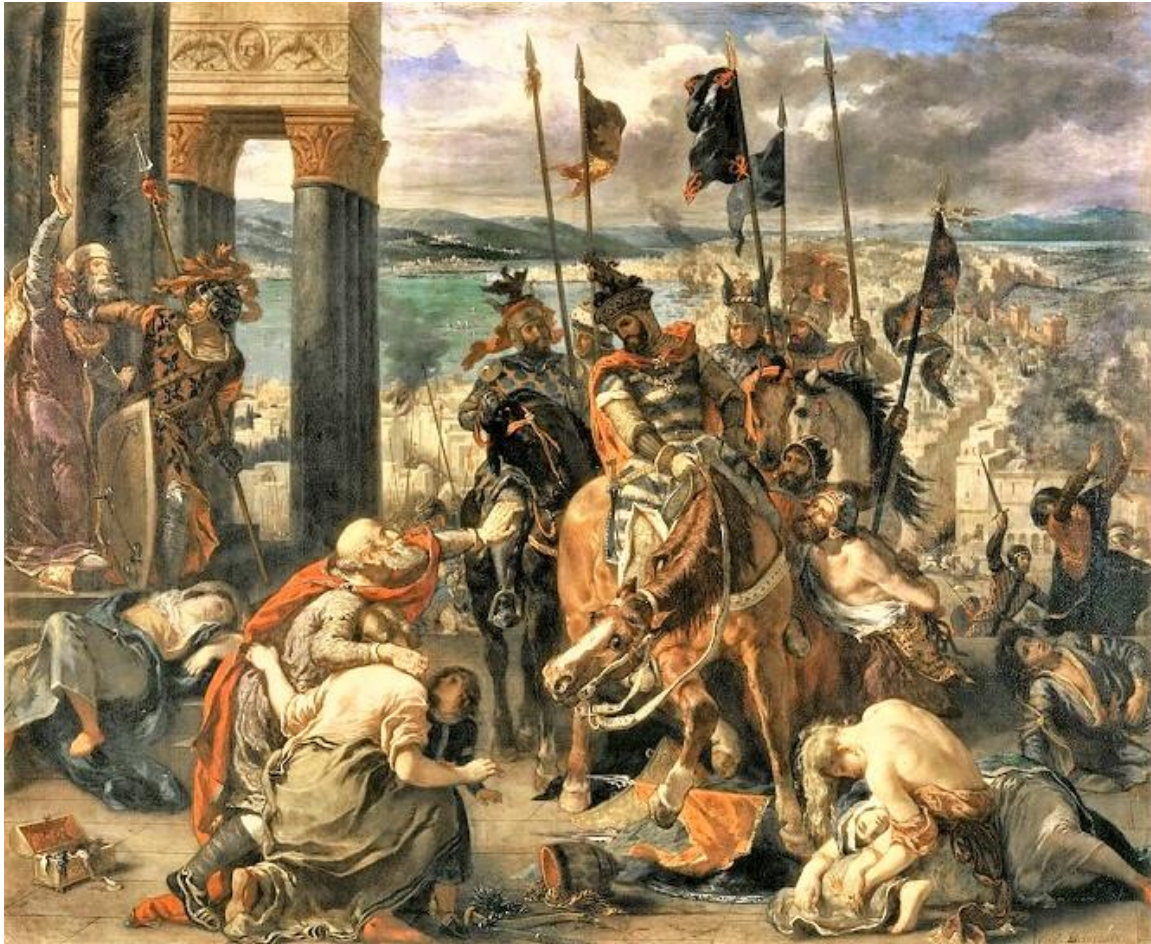
Sack of Constantinople, painting by Eugène Delacroix , Public Domain

usurping a couple thousand years of history, but who's counting anyways? On the way to the 4 th Crusade, the crusaders decided to stop and sack the headquarters of the Holy Eastern Christian Empire in Constantinople (now Istanbul).