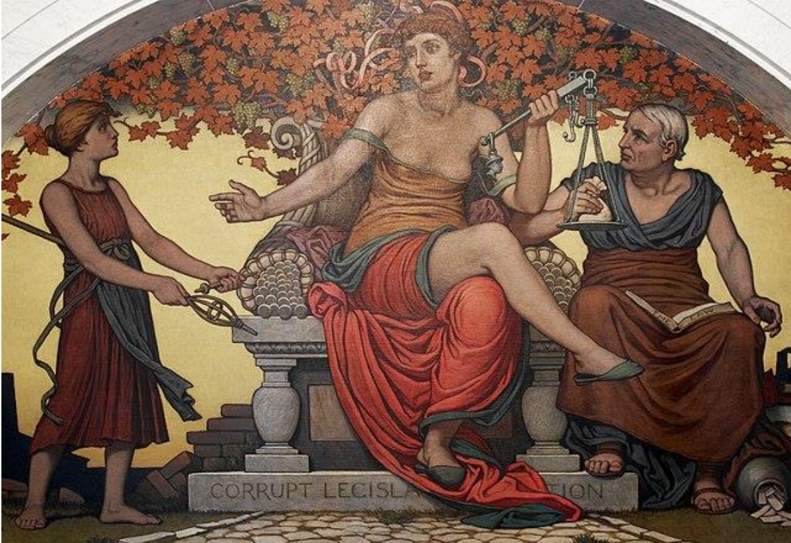
Corrupt Legislation, painting by Elihu Vedder (1896).

August 12, 2021 - Medieval 1 lasted about a thousand years from the fifth century to the late 15 th Century. Nearly the entire world is now deep off into Medieval 2 – the Tortures Continue.