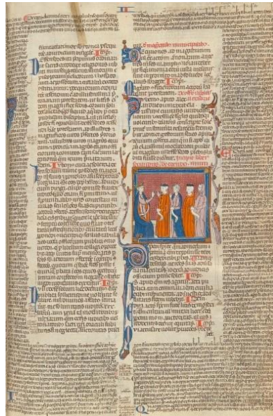
Fragment of manuscript Codex Justinianus

https://droitromain.univ-grenoble-alpes.fr/Anglica/CJ1_Scott.htm