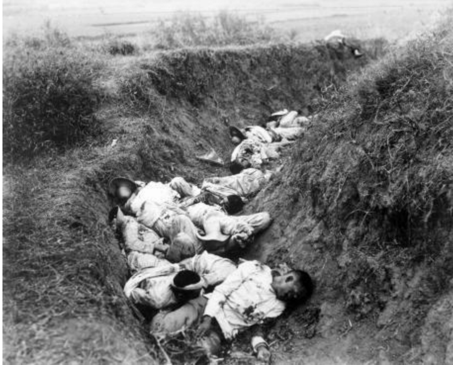
Filipino casualties on the first day of the war

https://libcom.org/history/us-conquest-philippines-1898-1902