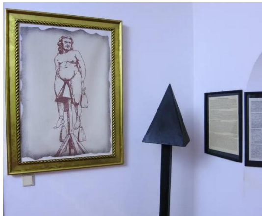
The Judas Cradle

being among the most barbaric and brutal... During this time, torture was often used to extract confessions, or obtain the names of accomplices or other information about crimes. Laws and local customs did not impose limits on the treatment of prisoners or the extent to which torture could be inflicted. In fact, confessions were not considered genuine or sincere when so-called "light torture" was used (such as toe wedging and strappado). Different types of torture were used depending on the victim's crime, gender, and social status. Skilled torturers would use methods, devices, and instruments to prolong life as long as possible while inflicting agonizing pain. Many prisoners were tortured prior to execution in order to obtain additional information; in many of these cases, the execution method was part of the torture endured by prisoners.