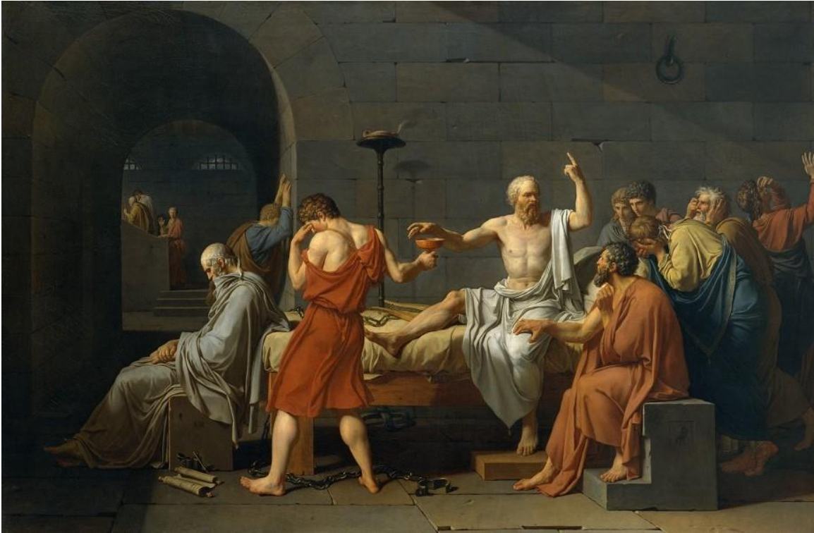
The Death of Socrates, painting by Jacques-Louis David (1787). Socrates, considered the father of western philosophy was sentenced to death for “corrupting the youth,” as the result of teaching the inevitable dangers of democracy.

In addition, the warnings contained in former President Eisenhower’s final speech concerning the dangers of the military-industrial complex went unheeded by far too many voters and consequently that complex has metastasized into the military-industrial-news and entertainment media-university-medical-psychiatric-judicial-prison complex!