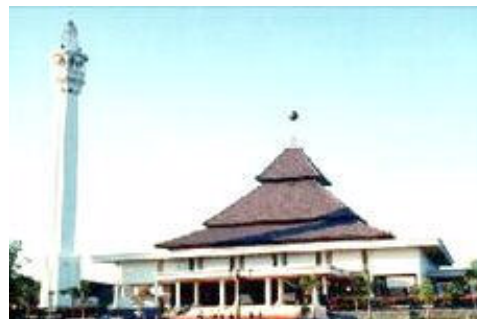
Indonesia has the largest Muslim population in the world. Islam spread to Indonesia by way of merchants and traders.

The Prophet (p) cursed one who employs a labourer and gets the full work done by him but