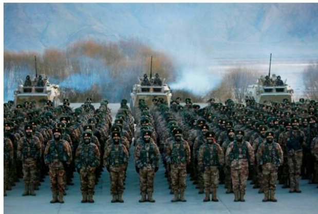
Chinese soldiers during a training exercise in Xinjiang in January.

The warning from the 30-country alliance , that China increasingly poses a global security problem, signaled a fundamental shift in the attention of an institution devoted to protecting Europe and North America.