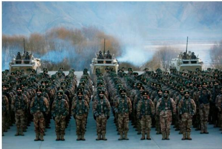
Chinese soldiers during a training exercise in Xinjiang in January.

The warning from the 30-country alliance , that China increasingly poses a global security problem, signaled a fundamental shift in the attention of an institution devoted to protecting Europe and North America.